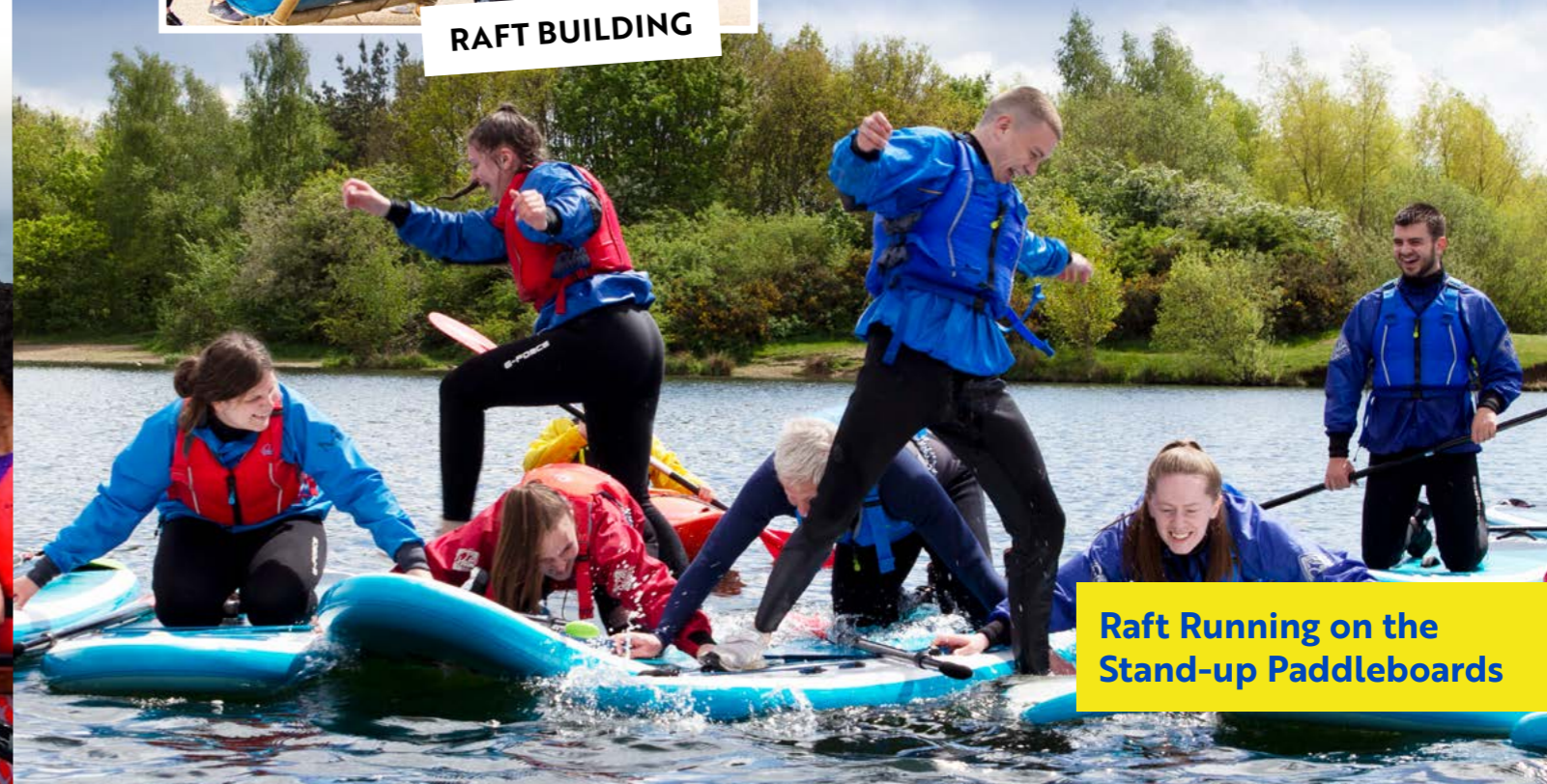
Raft Running on the Stand-up Paddleboards